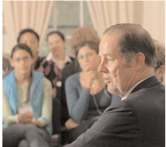
Governor Kean answers questions from students.

"For people to feel politics isn't their business is a recipe for disaster in a democracy."