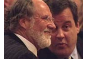
1 of 1 Click to enlarge

Another issue facing New Jersey is same sex marriage, which Christie opposes. Sources tell CBS 2 that sponsors of the bill to legalize it will try to push it through before Corzine leaves office. Corzine has said he will sign it.