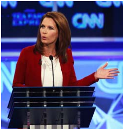
Michele Bachmann in Monday's GOP presidential debate

Posted Wednesday, Sept. 14, 2011, at 3:15 PM ET